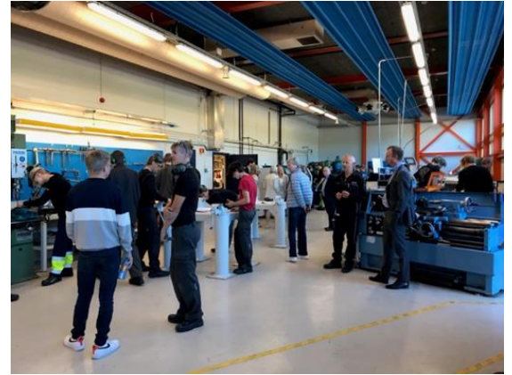
Image 4 – Informal conversations during workshop together with county policymakers in Norway.